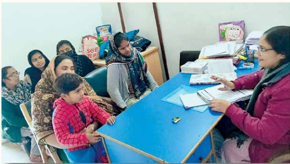
Mothers enrolling for the literacy programme

This is a 2-year Pilot Literacy Programme in two schools. It aims to focus on mothers and sisters of students in each school, to teach basic reading and writing skills in Urdu and English and mathematics. Chopan Trust will provide a tutor's salary, free books and school supplies.